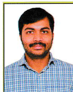
Team Leader, Go-jek Engg. S/W Develop. Bangalore