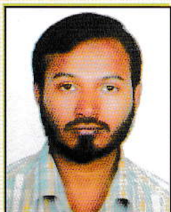
Assistant Professor, MGM College, Aurangabad.