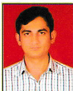
Developer, Mind Planet Technologies, Pune