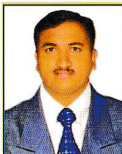
Assistant Professor, Solapur University, Solapur