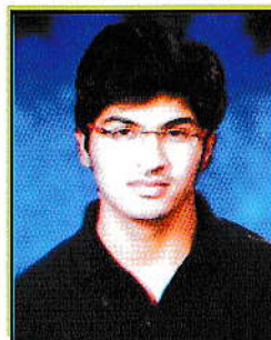
Assistant Manager, HDFC Bank, Pune