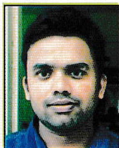
Sr. SAP Basis Consultant, ZS Associates India Pvt. Ltd., Pune