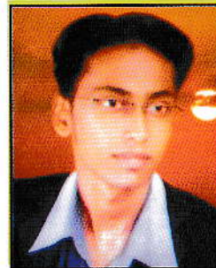
Deputy Manager, Reliance Retail Ltd., Pune