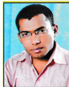
Project Co-ordinator, Dhanlaxmi Electricals, Pune