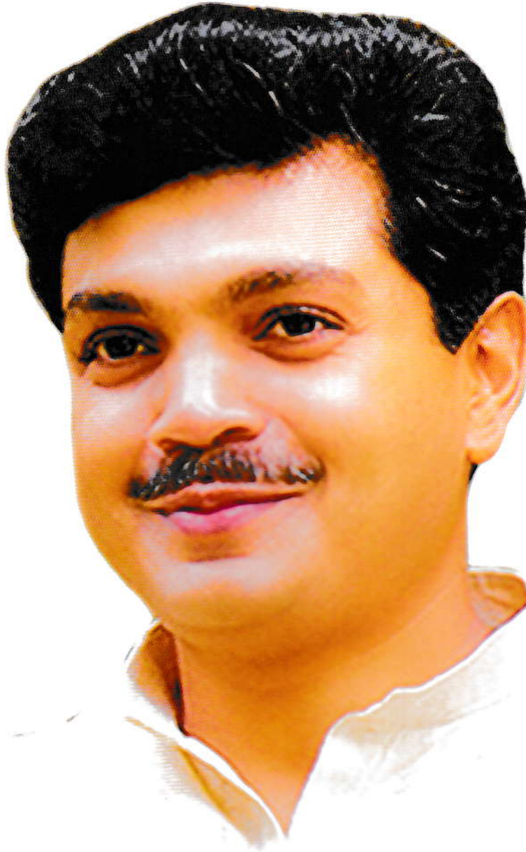
Hon. Shri. Ranajagjitsinhaji Patil M.L.A. & Ex. State - Minister, Govt. of Maharashtra