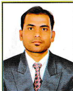
Assistant Consultant, TCS, Belgium