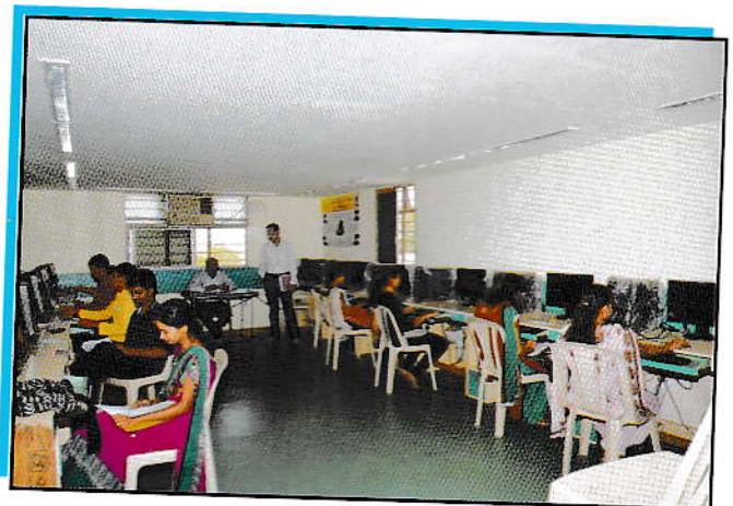
Computer Lab 3