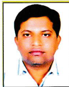
Team Leader, Clover Infotech Pvt. Ltd., Pune