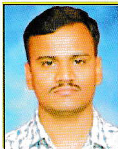
Software Engineer, Altra Infotech Pvt. Ltd., Pune