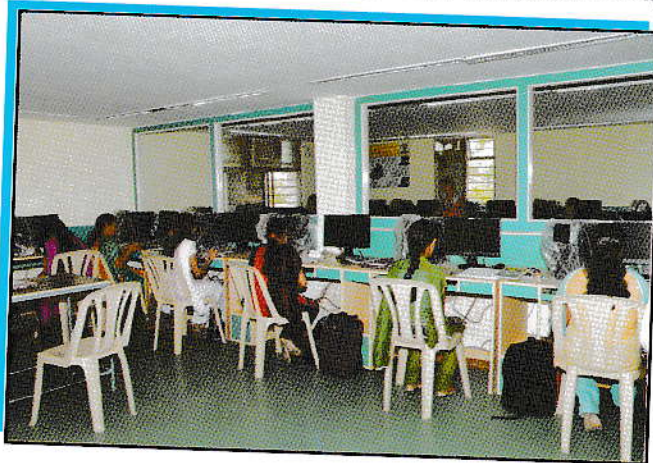
Computer Lab 2

Any miss behavior on the part of the student may lead to disciplinary action by the college authority.