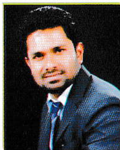
FTA Manager, Bharati Airtel, Osmanabad