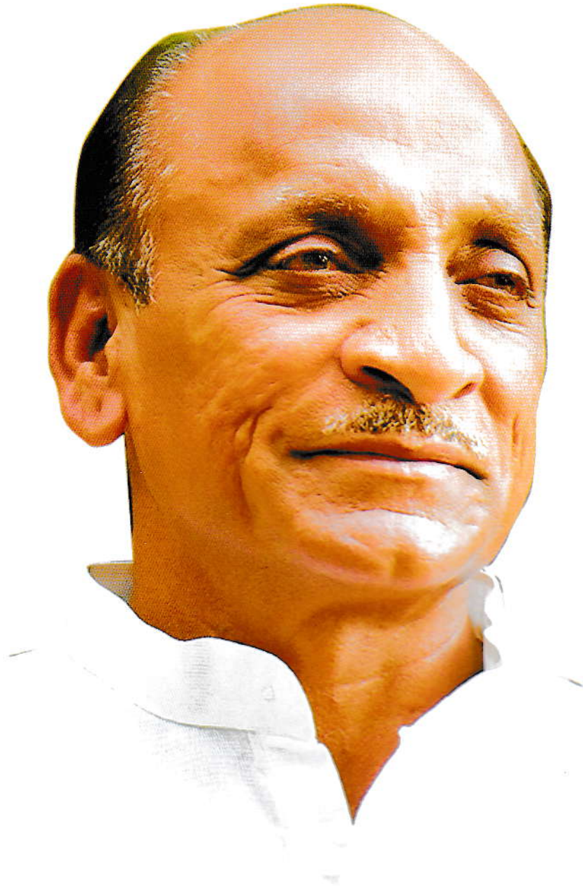
Hon. Dr. Padmasinhaji Patil Ex. M.P. & Ex. Minister, Govt. of Maharashtra