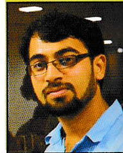
Windows System Administrator TCS, Pune