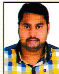
Web Designers Karyotypew software pvt ltd.