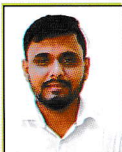
Software Engineer Tata consultancy Services Mumbai