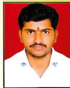
Project Engineer Wipro Technologies, Pune