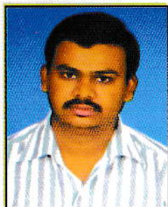
Manager, Oriental Insurance Ltd., Osmanabad