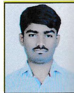
Senior Software Developer Ansh Systems pvt ltd, Pune