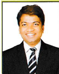
Manager, Bandhan Bank Ltd. Mohal