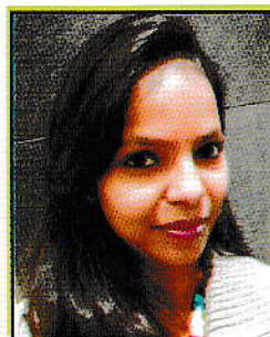
Assistant Manager Vodafone India Shared Services, Pune.