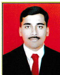
Associate Consultant, Infogain India (P) Ltd., Pune